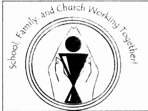
Full Back Imprint

School t-shirts are now available for students and families. The colored t-shirts will be soft yellow with royal blue print.